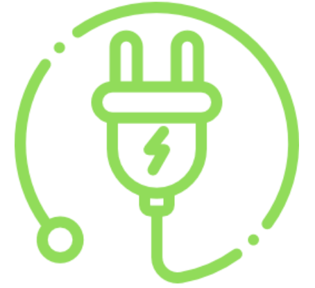
Energy & Minerals