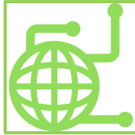
Information & Emerging Tech